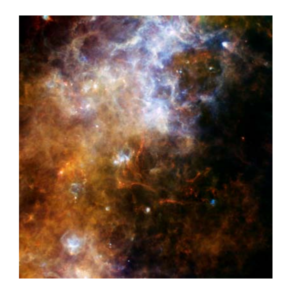
Left: the very first PACS observation of M51. Righ:t SPIRE/PACS parallel mode image of a field on the galactic plane. See <u>http://herschel.esac.esa.int/latest_news.shtml</u> for all web-releases.