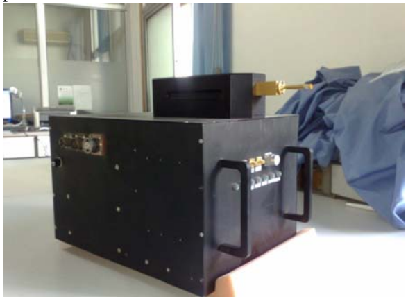
Fig. 2. 220GHz Cloudsat radar diagram

The block diagram of the terahertz radar is shown in Fig 1. The 220GHz stepped frequency pulse imaging system consists of five modules, signal sources, front-end, IF module, signal process and antenna.