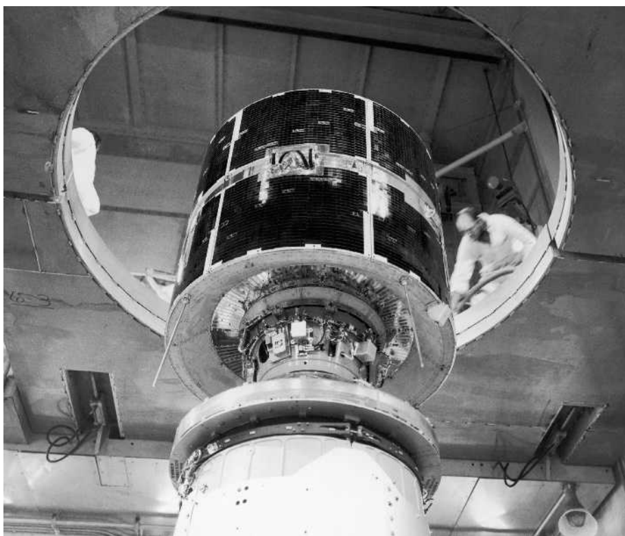
COS-B, one of Europe's most successful missions, and ESA's first, was used to study gamma-ray sources.

an X-ray Super Telescope; a next-generation gravity-wave explorer; and a Jupiter/Europa probe. Although ministers at December's council meeting will not be allocating funds to the Cosmic Vision plan, a broad commitment is hoped for. If all goes well, calls to the community for concrete mission proposals will start early next year.