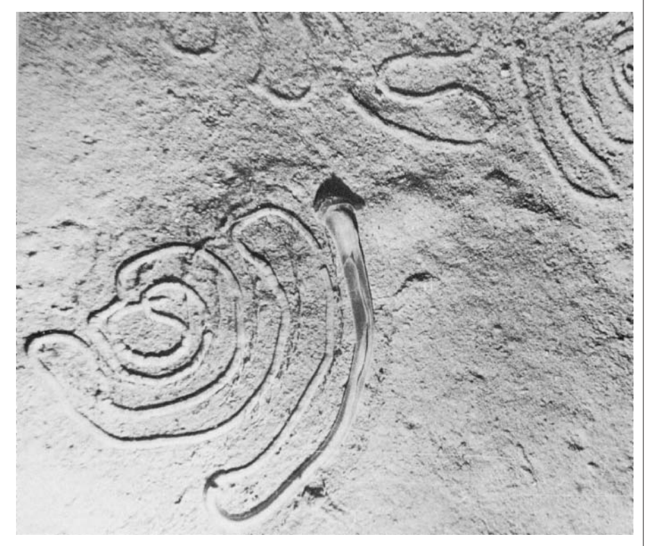
Figure 1 Worm turns — the first photograph, taken in 1962, of an abyssal enteropneust worm lying on the sea bed near the eastern wall of the Kermadec Trench in the southwestern Pacific. The worm's body ends shortly past the first bend, where the faecal coil begins. (Reproduced from ref. 4.)

slits and a hollow, dorsal nerve cord. But in other ways, the two main hemichordate classes — the microscopic, tube-dwelling 'pterobranchs', which feed on suspended particles, and the much larger, mudswallowing'acorn'worms (the enteropneusts) — differ considerably from each other in lifestyle and anatomy. A reassessment of the evolutionary histories of the pterobranchs and enteropneusts is now prompted by